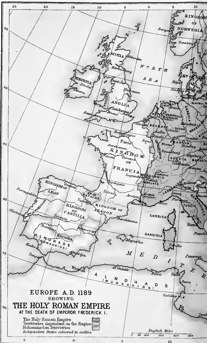
EUROPE A.D. 1189 SHOWING THE HOLY ROMAN EMPIRE AT THE DEATH OF EMPEROR FREDERICK I.