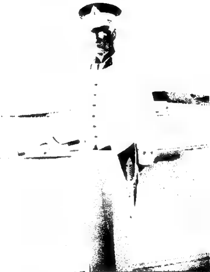
A Monsieur Raymond Poincaré, Président du Conseil des Ministres, de la part d'Édouard Prince de Galles, en souvenir de son séjour à Paris en 1912.