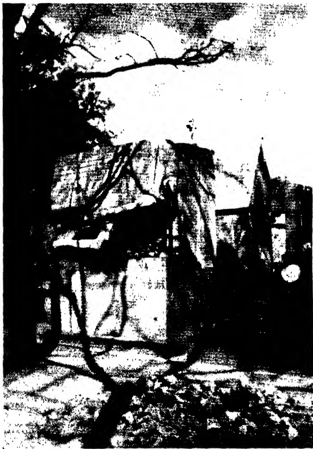
OSCAR WILDE'S TOMBSTONE, BY JACOB EPSTEIN, IN PÈRE LA CHAISE