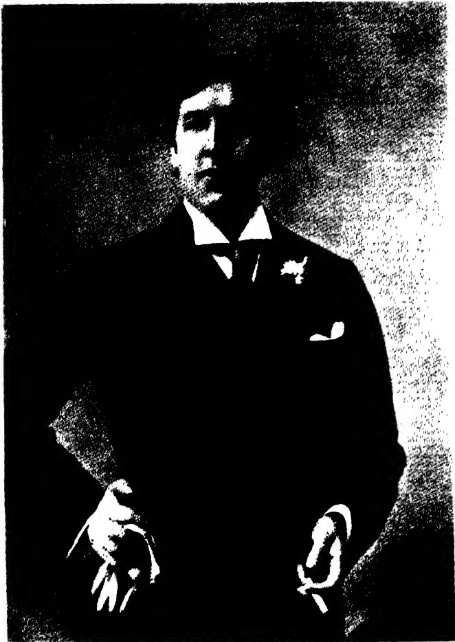
OSCAR WILDE, 1892