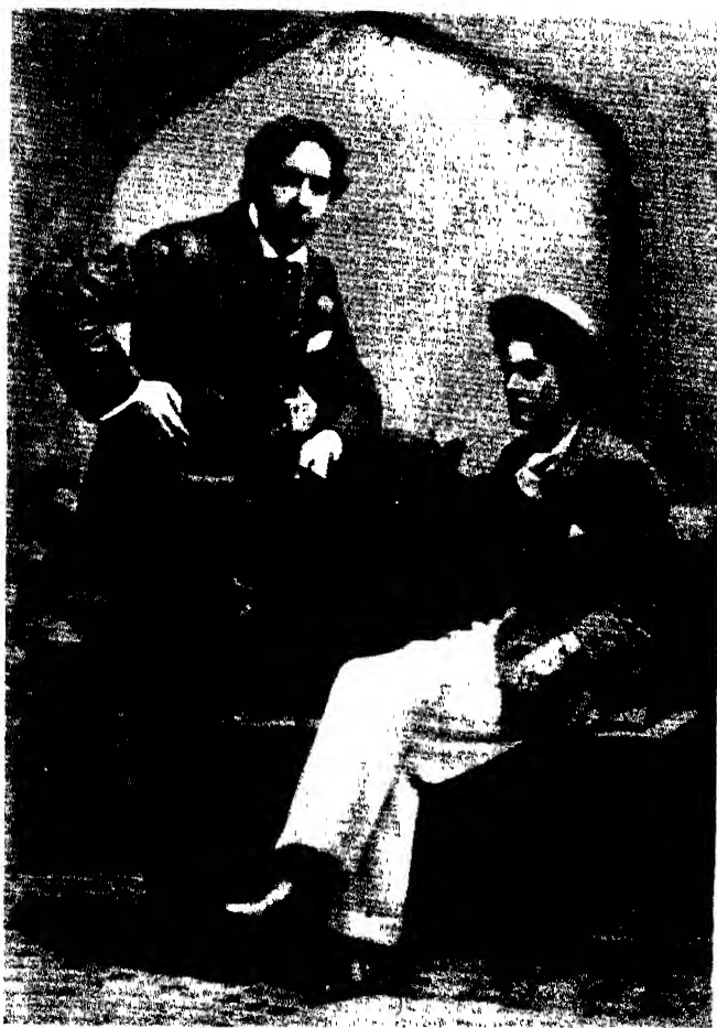
OSCAR WILDE AND LORD ALFRED DOUGLAS, 1894