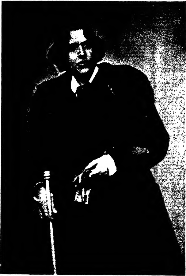
OSCAR WILDE IN AMERICA