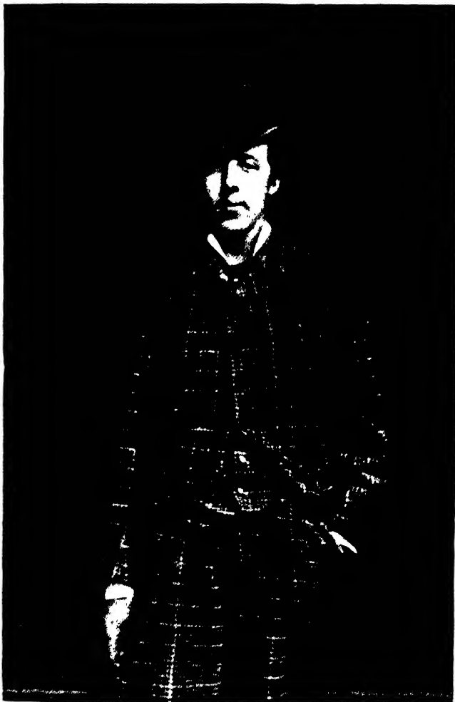
OSCAR WILDE AT OXFORD