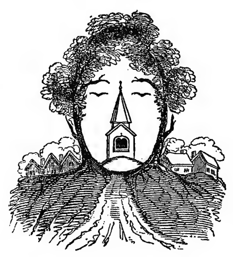
THE LADY OF "OUR VILLAGE."

"We thought her dying when she slept, And sleeping when she died."