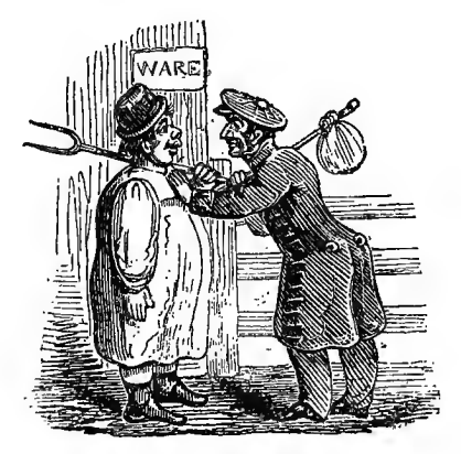
"SARE, I AM AT WHERE?—" "WELL, I KNOW YOU BE!"

It is worth recalling, too, that it was in January, 1817, that the Literary Gazette —the first weekly literary review—started on a career of prosperity which remained unchallenged until the Athenæum superseded it more than a dozen years later.