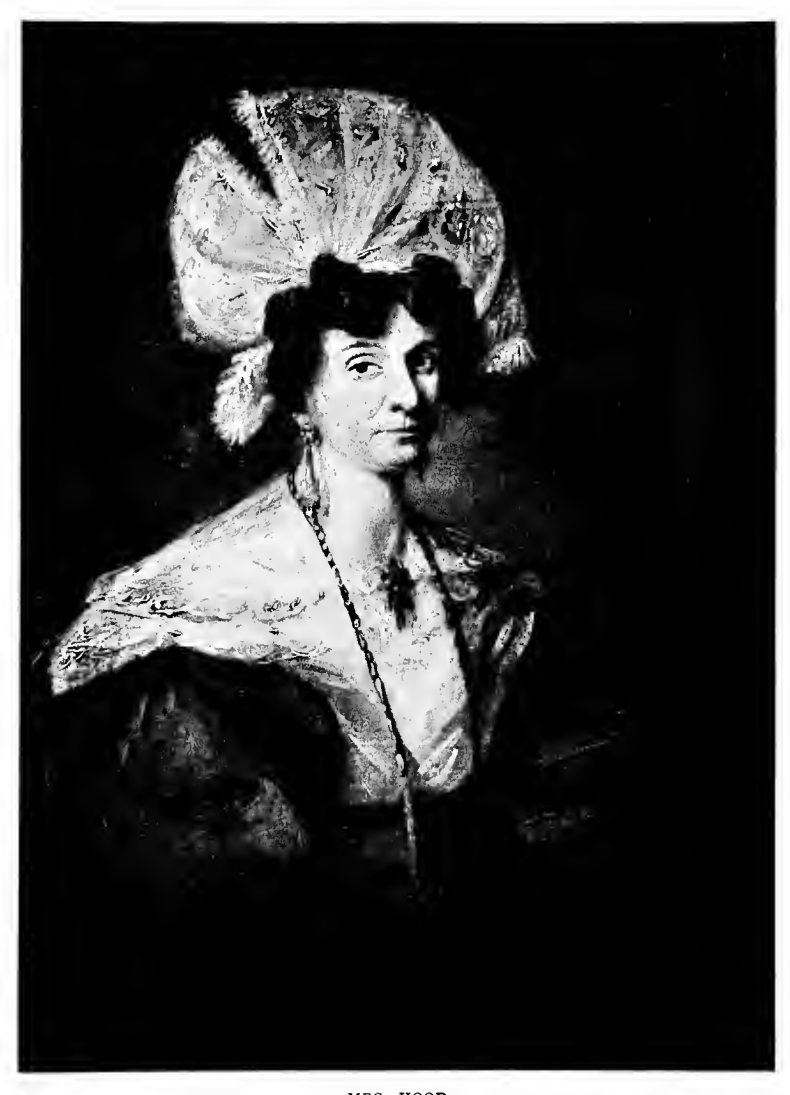
\label{eq:MRS.HOOD.} \mbox{MRS. HOOD.} From the Painting in the National Portrait Gallery