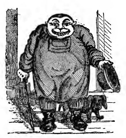
"HAVE I A WOTE FOR GRINNAGE?"

"P.S. Don't forget my little crab to dance the Polka, and pray write to me soon as you can't, if it's only a line."