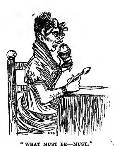
WHAI MUSI BE-MUSI.

This is not the place to deal at length with the characteristics of Hood's poetry. Enough has been said perhaps to show that by the publication of this volume in 1827 he had definitely fixed his place among contemporary writers. It is true that "The Plea of the Midsummer Fairies" was not a commercial success, but if it was more or less ignored by book-buyers of the day later generations have found in it much of that by which they remember the author, and in a survey of his life as a whole it is seen to have an important place, indicating by its excellence the quality of his genius as a poet, and showing by its reception how he was more or less strongly compelled to turn his attention to the producing works which in another art would be described as pot-boilers.