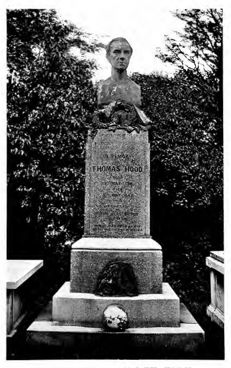
THE THOMAS HOOD MEMORIAL, KENSAL GREEN CEMETERY.