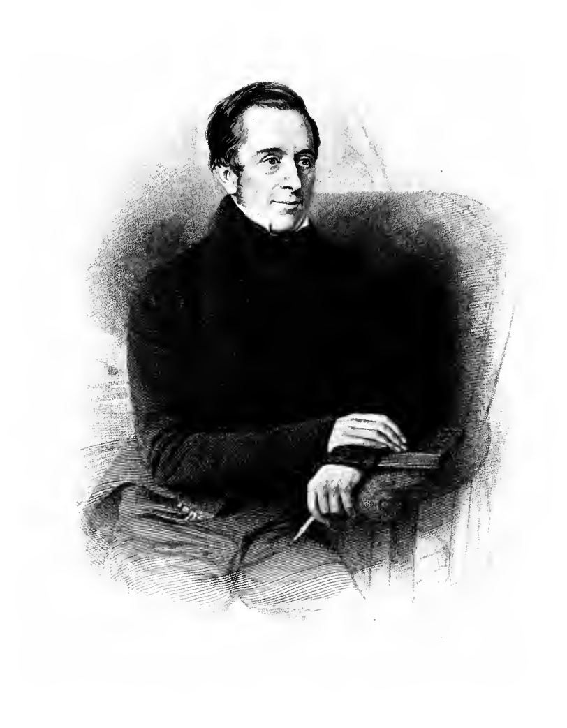
Te .... 14000