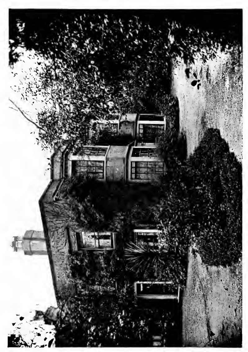
ROSE COTTAGE, WINCHMORE HILL.