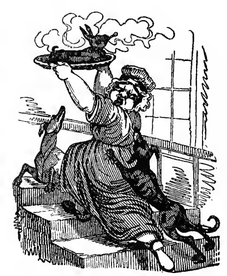
A SECOND COURSE.

escape the rash rejection of a jaded editor; so, having got in your hand, it is possible that your head may follow; and so, last not least, ye may fortunately avert those awful mistakes of the press which sometimes ruin a poet's sublimest effusion, by pantomimically transforming his roses into noses, his angels into angles, and all his happiness into pappiness."