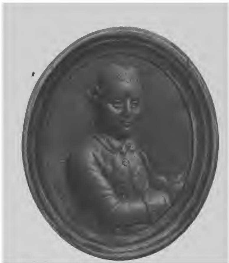
PAUL JONES FROM A WAX MEDALLION PORTRAIT SIGNED W S 1798