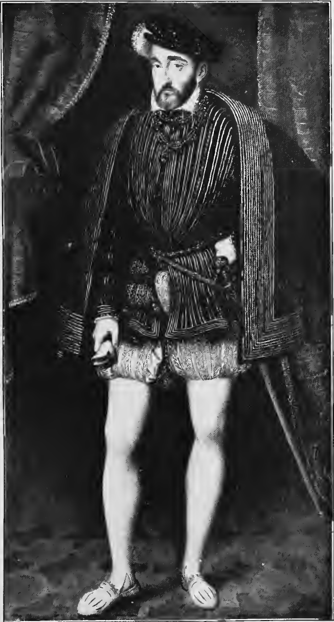
HENRY II, HUSBAND OF CATHERINE DE MÉDICIS From a painting in the Louvre attributed to François Clouet