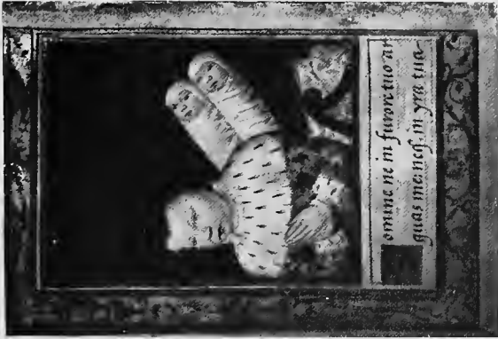
THE SECOND SON OF CATHERINE AND HER TWIN DAUGHTERS, WHO DIED SHORTLY AFTER THEIR BIRTH

From the prayer-book of Catherine de Médicis, made to be swung from a chain at the girde—now in the Louvre