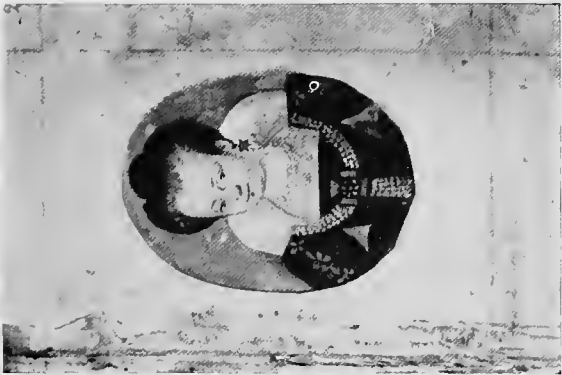
QUEEN CATHERINE DE MÉDICIS IN HER YOUTH WHEN SHE WAS MARRIED TO HENRY, DUKE OF ORLEANS, AFTERWARDS KING OF FRANCE