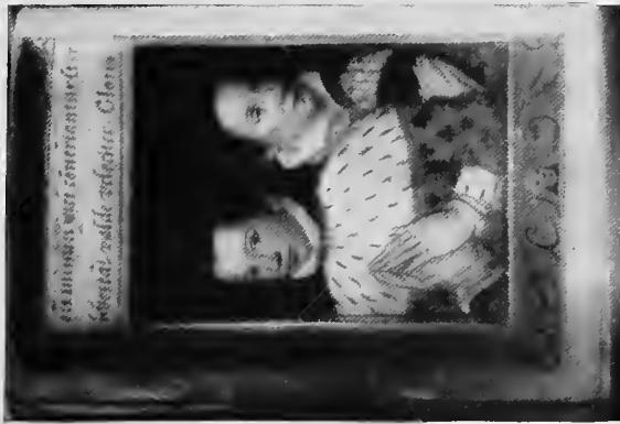
FRANCIS II AND HIS WIFE, MARY STUART, QUEEN OF SCOTLAND