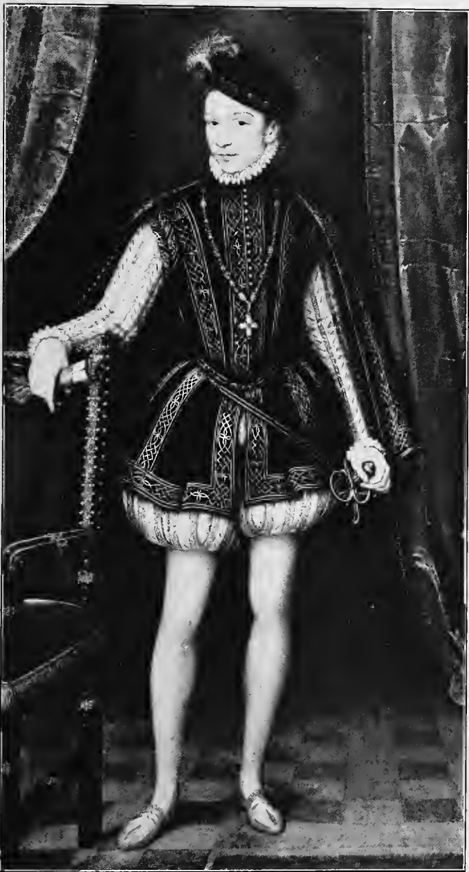
CHARLES IX, SECOND SON OF CATHERINE DE MÉDICIS From a painting in the Louvre attributed to François Clouet