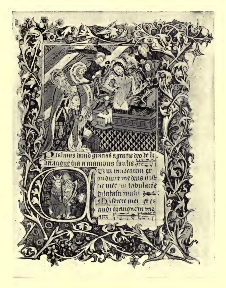
A PAGE FROM THE DUKE OF GLOUCESTER'S PSALTER.