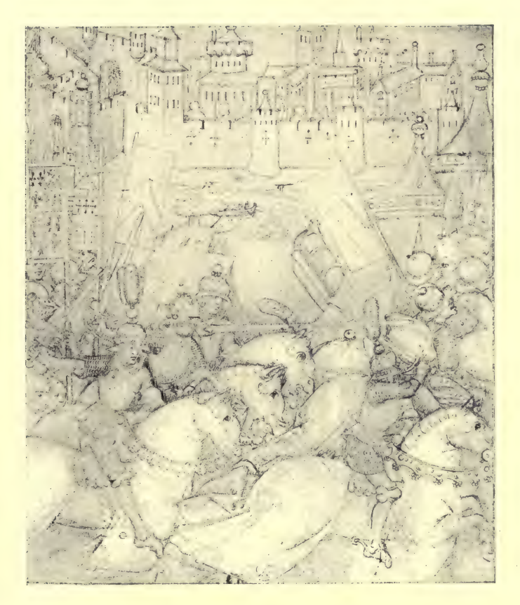
THE SIEGE OF CALAIS IN 1436. From a Drawing.