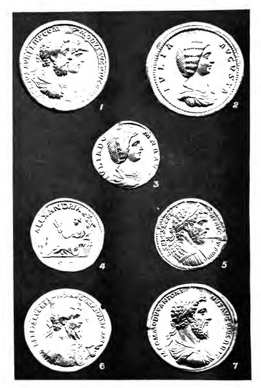
SEVEN COINS OF THE PERIOD.