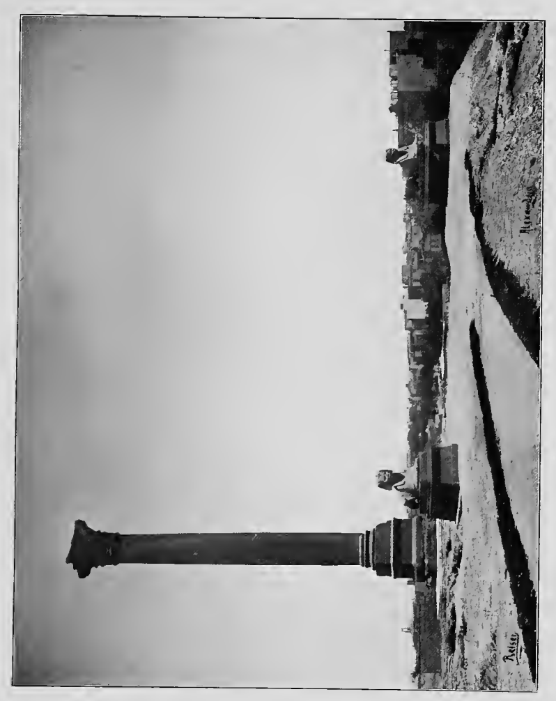
POMPEY'S PILLAR IN ALEXANDRIA,