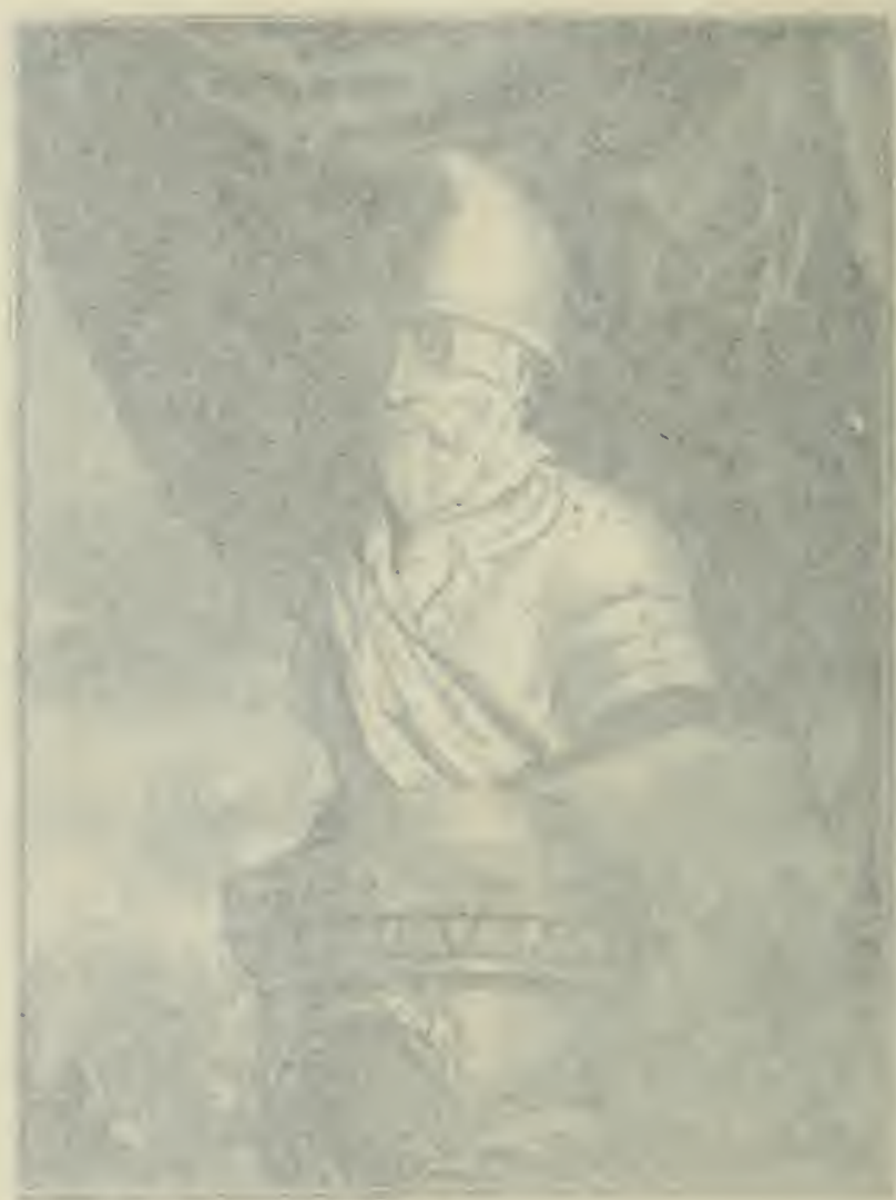
John Bull of the ...