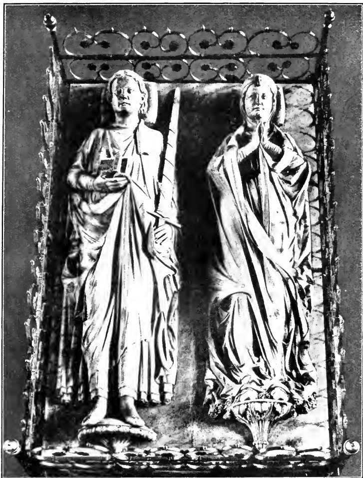
TOMB OF HENRY THE LION AND HIS WIFE MATILDA IN THE CATHEDRAL OF ST. BLASIUS AT BRUNSWICK