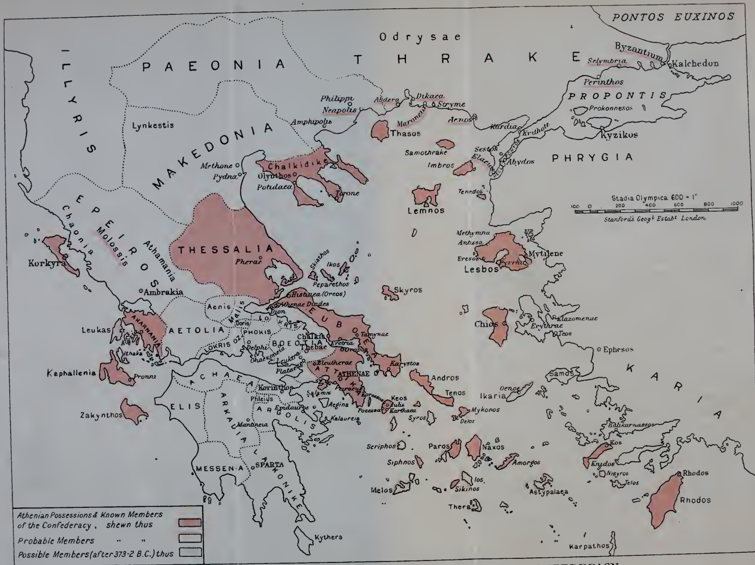
MAP SHOWING THE EXTENT OF THE SECOND ATHENIAN CONFEDERACY ABOUT THE YEAR 373-2 B.C.