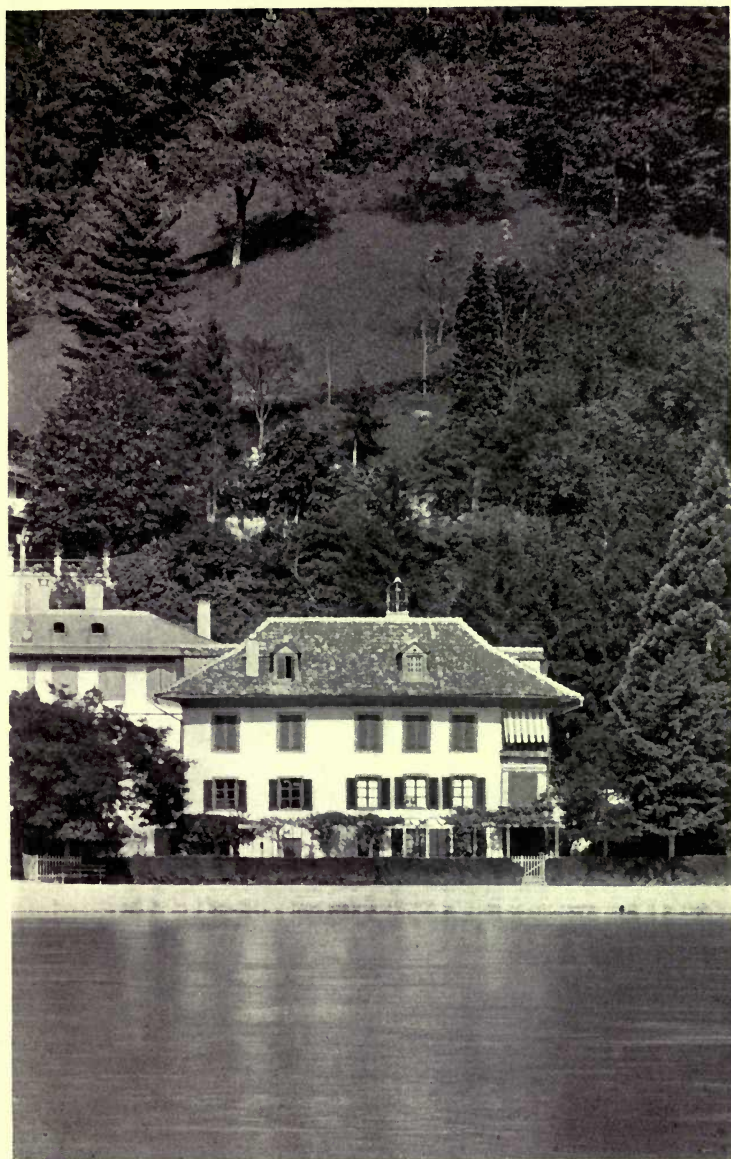
BRAHMS' LODGINGS NEAR THUN.