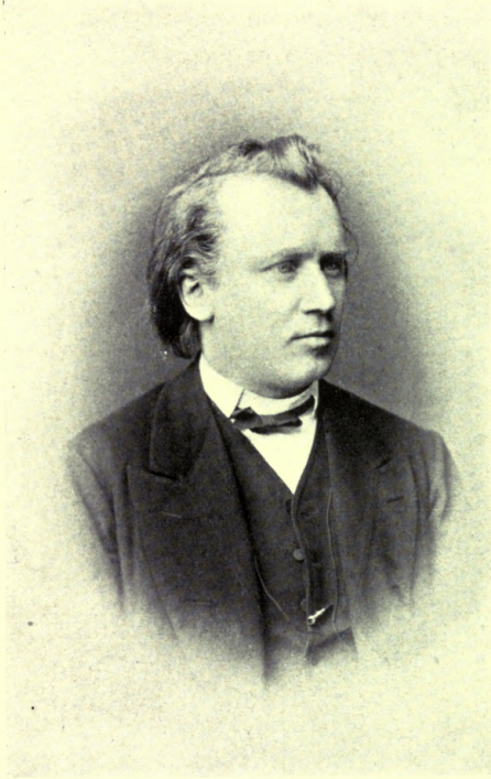
BRAHMS AT THE AGE OF 40.