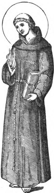
St. Antony of Padua (Sienese School)

merely anxious to make an experiment. "Is it not said in the Holy Gospel," they urged, "'eat that which shall be set before you?' And again, 'if ye drink any deadly thing it shall not harm you?'"