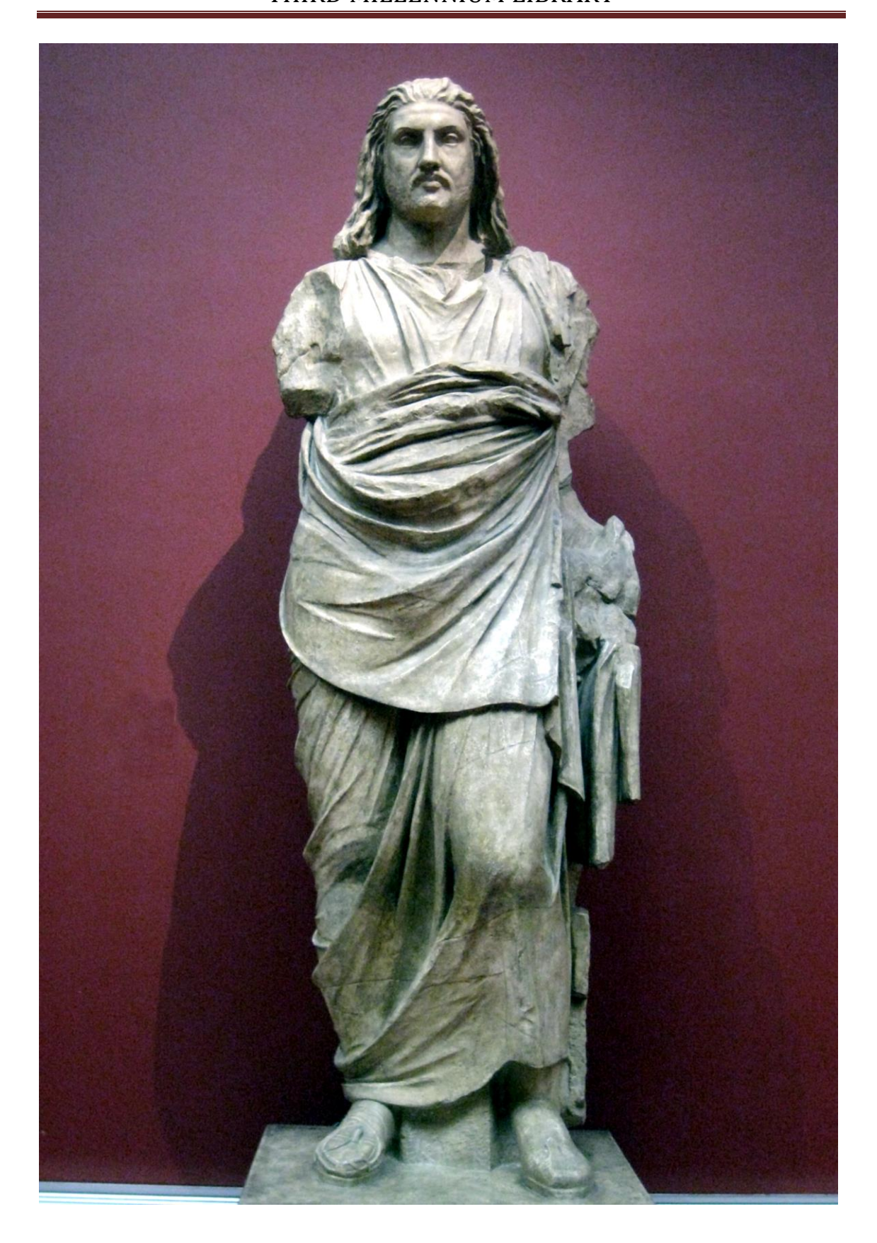
Sect. 4. Phocis and the Sacred War