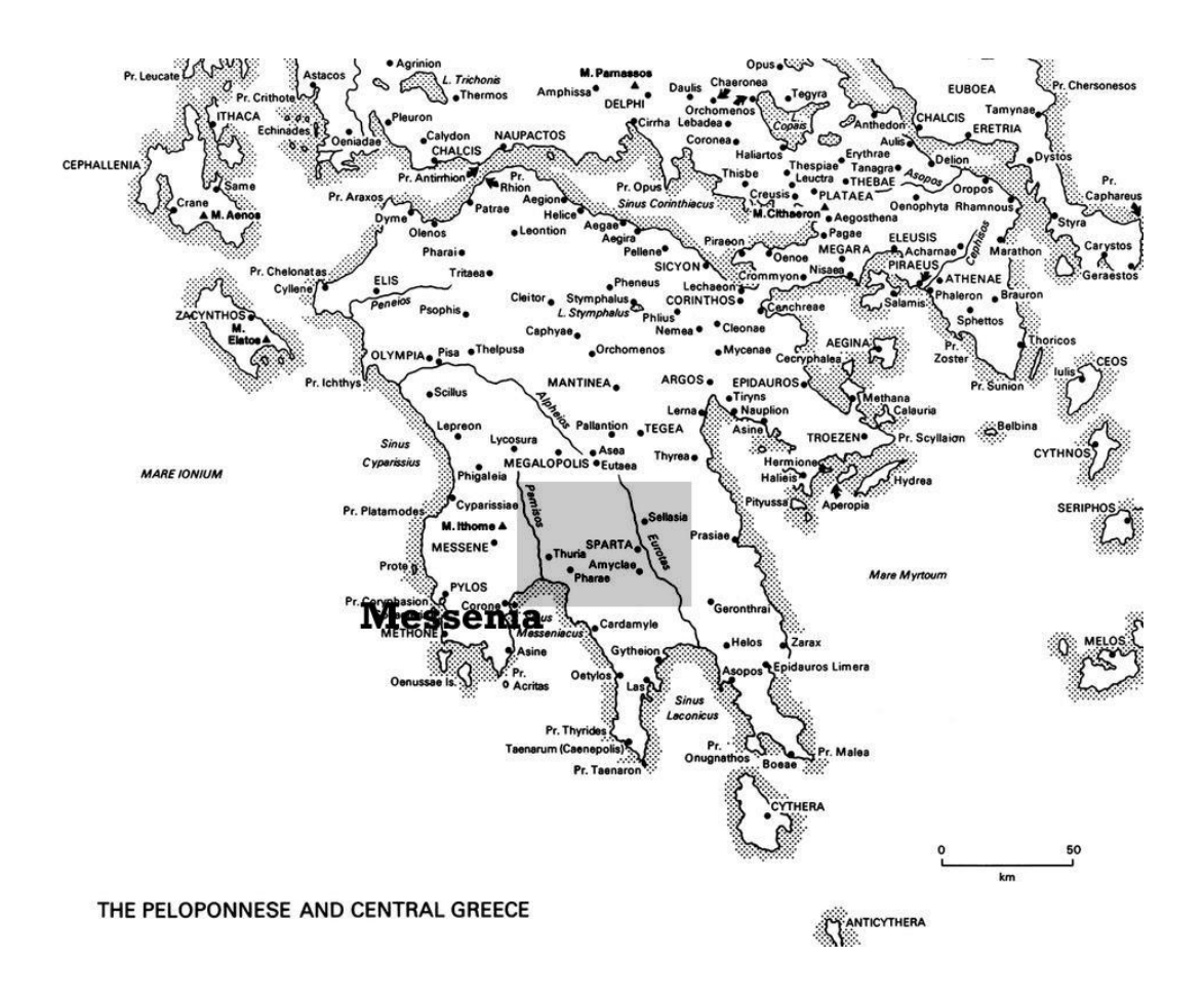
Sect. 2. Spartan Conquest of Messenia

path as other states and had to face the same political crises, she overcame each crisis with less violence and showed a more conservative spirit. When she ought to have passed from royalty to aristocracy, she diminished the power of the kings, but she preserved hereditary kingship as a part of the aristocratic government. When she ought to have advanced to democracy, she gave indeed enormous power to the representatives of the people, but she still preserved both her hereditary kings and the Council of her nobles.