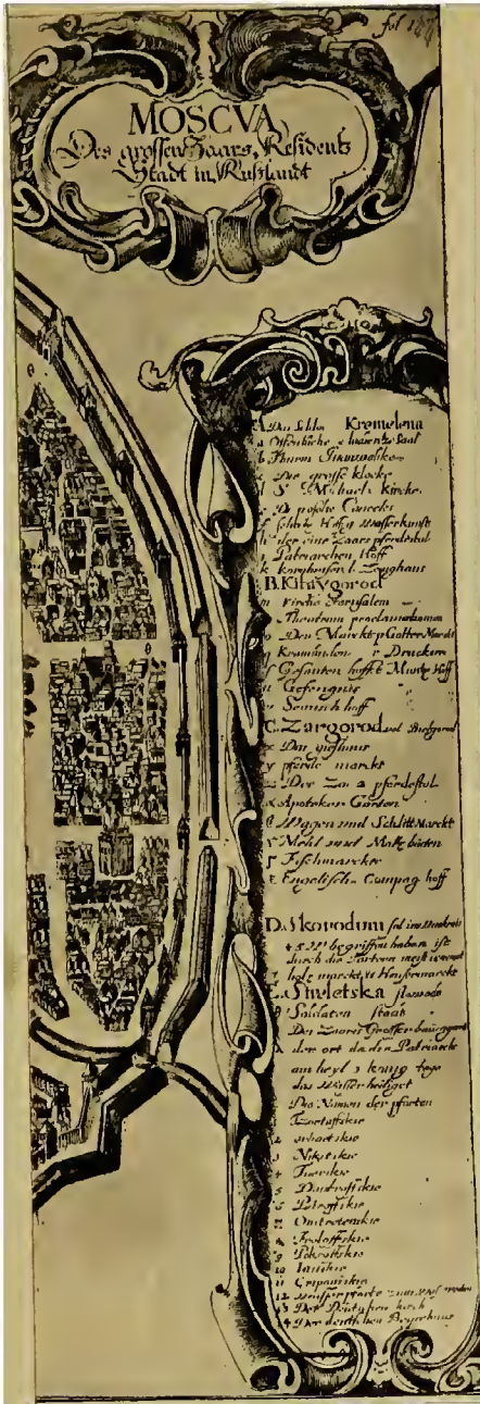
THE SUBURB OF THE STRVELTSUI OR MUSKETEERS. IN SETTLEMENT.