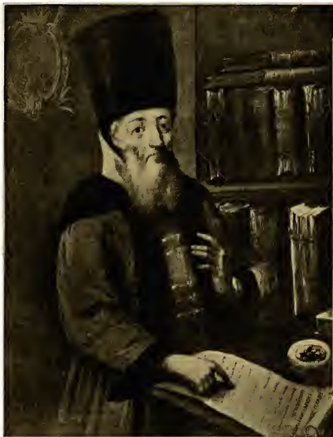
THE FIRST RUSSIAN CHANCELLOR. ANASTASY ORDUIN-NASHCHOKIN.