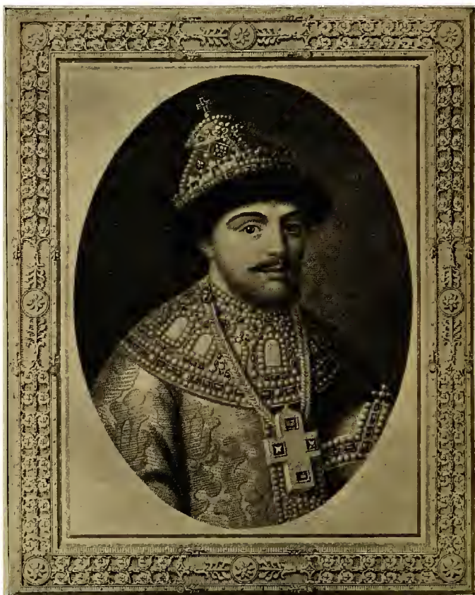
TSAR THEODORE III.