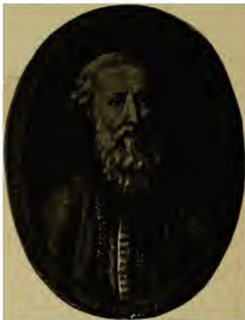
ARTAMON MATVYEEV. THE GREAT REFORMING BOYAR.