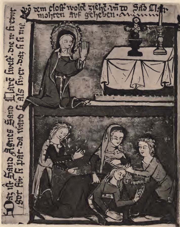
HOW SAINT AGNES BY VIRTUE OF SAINT CLARE'S PRAYERS IS SAVED FROM BEING CARRIED AWAY FROM HER CONVENT.

(From MS. M.281 Royal Library, Dresden.)