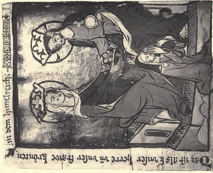
HOW OUR LORD AND OUR LADY CROWNED SAINT CLARE IN HEAVEN. (From MS. M.281 Royal Library, Dresden.)