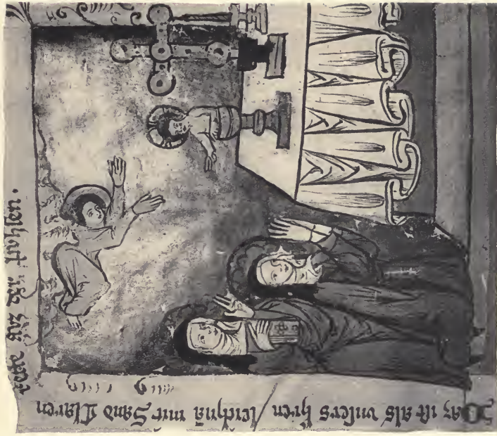
HOW THE BODY OF OUR LORD APPEARED TO SAINT CLARE FROM OUT OF THE CHALICE.

(From MS. M.281 Royal Library, Dresden.)