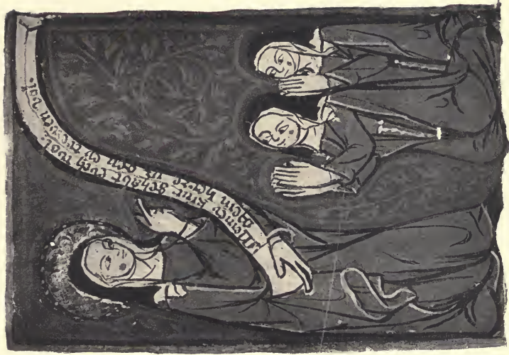
SUBJECT UNCERTAIN: PROBABLY BLESSED AGNES OF BOHEMIA AND TWO SISTERS. (From MS. M.281 Royal Library, Dresden.)