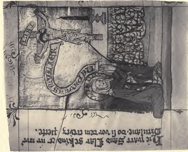
HORTULANA, MOTHER OF SAINT CLARE PRAYING BEFORE THE CRUCIFIX.

(From MS. M.281 Royal Library, Dresden.)