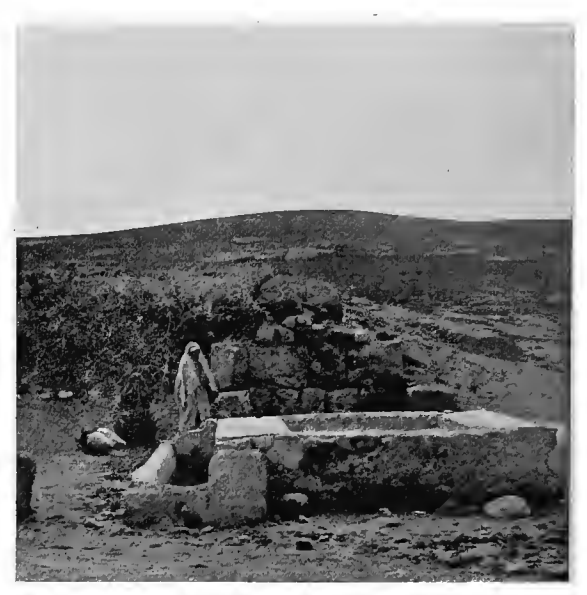
Ruins near Utica, supposed Tower of Agathocles.

hands, but the Numidians still awaited the issue of the whole war. If only Carthage could be attacked from the sea, she would hardly defy Agathocles any longer, and in any case she might-have been glad to make peace. But in Sicily the cause of Agathocles had for some time