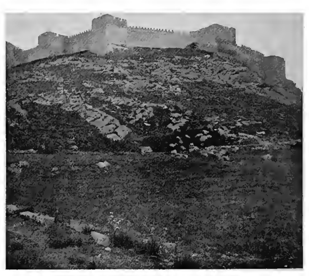
Citadel of Aspis (Kelibia), with Arab Castle.

Agathocles had now subdued all the civilized part of the eastern coast. He strengthened his hold by founding a dockyard and haven at Aspis. The new harbour took its name from the neighbouring shield-shaped hill which is a far-seen height along the flat strand. This rising made a safe stronghold and a good