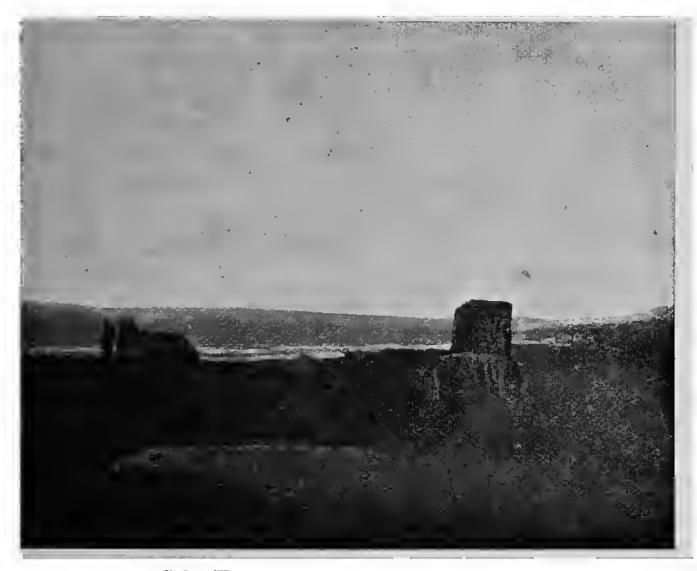
Gela (Terranova); Remains of Temple.

Of the war which followed very little is known. Diodorus merely says that great forces were pitted against