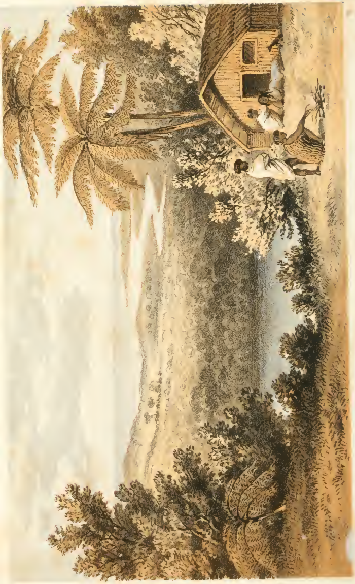
BANKS OF THE WAITARA, NEW ZEALAND