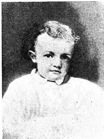
Lenin at the age of three