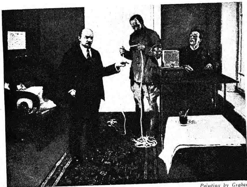
Painting by Grabar