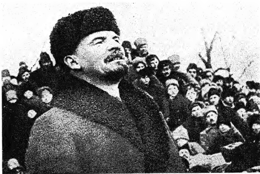
Lenin at the Red Square, speaking at Sverdlov's funeral