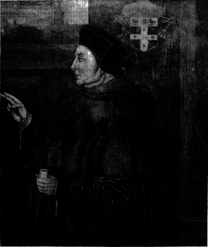
Thomas Wolsey, Cardinal