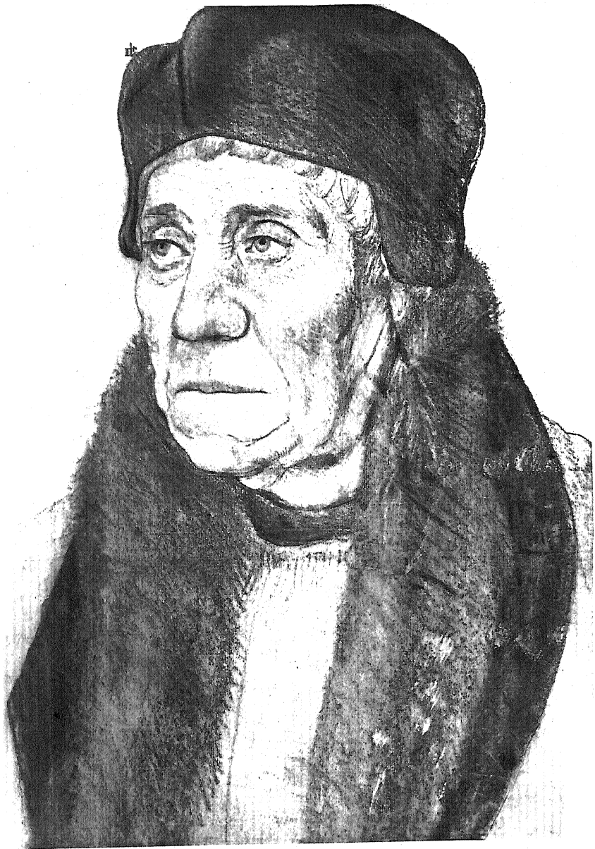
William Warham, Archbishop of Canterbury