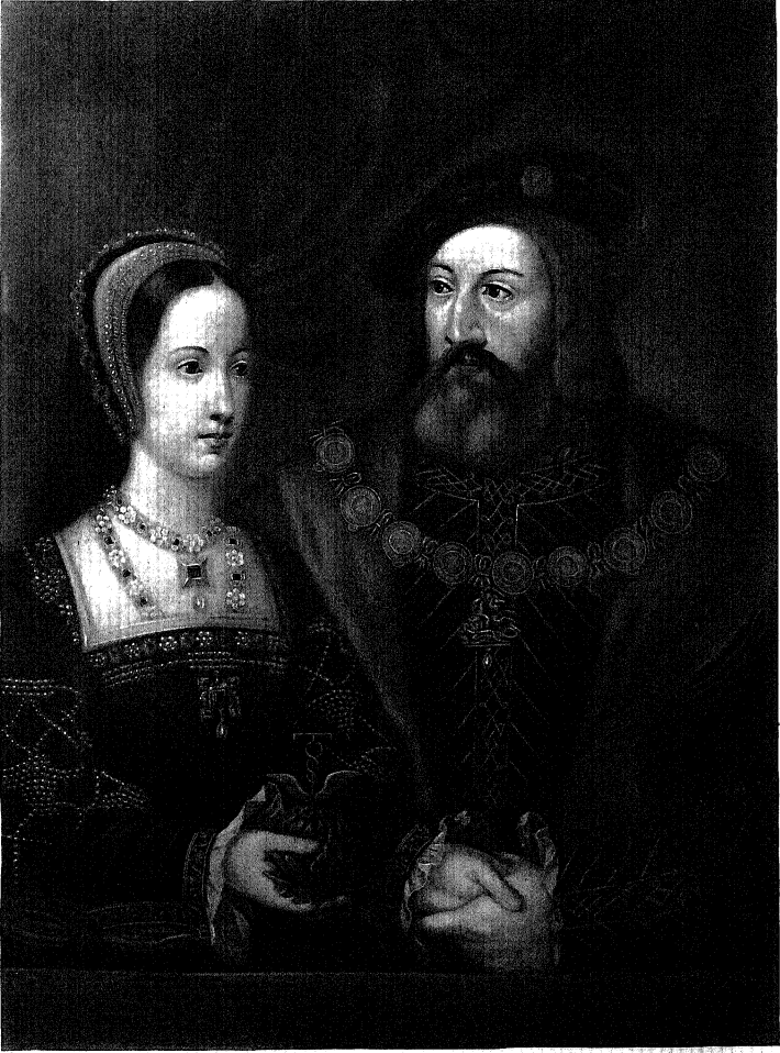
Mary Tudor and Charles Brandon