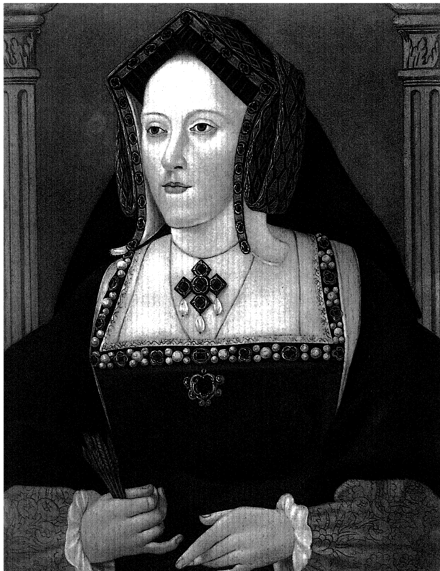
Catherine of Aragon