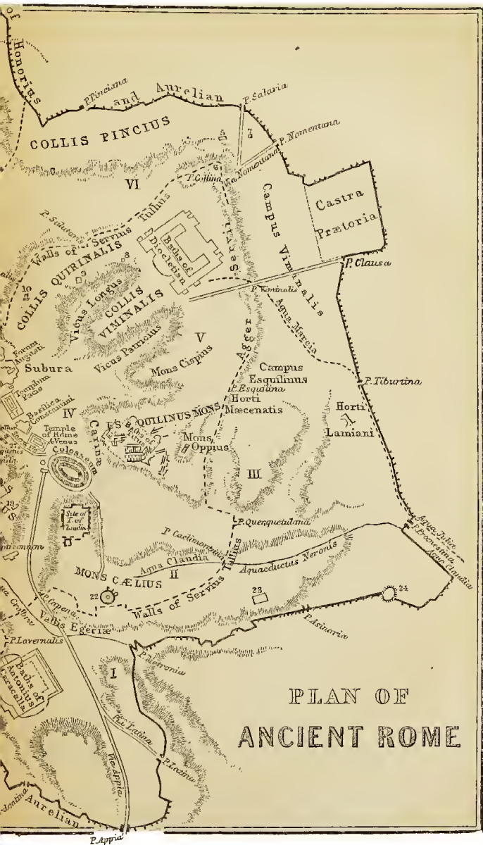
PLAN OF ANCIENT ROME