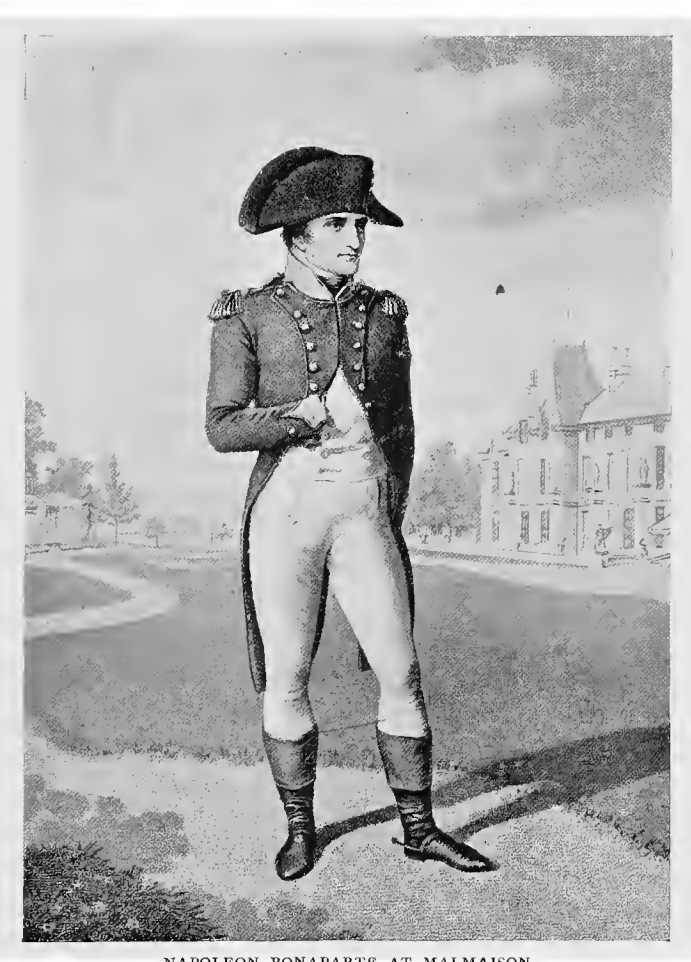
NAPOLEON BONAPARTE AT MALMAISON. From an engraving after the picture by Isabey.