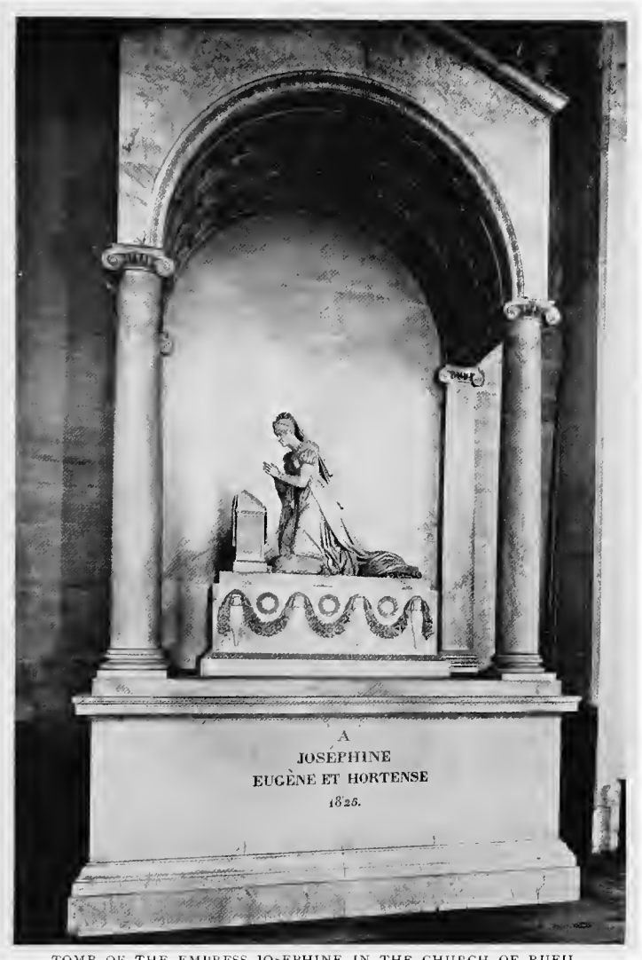
TOMB OF THE EMPRESS JOSEPHINE IN THE CHURCH OF RUEIL. p. 618.