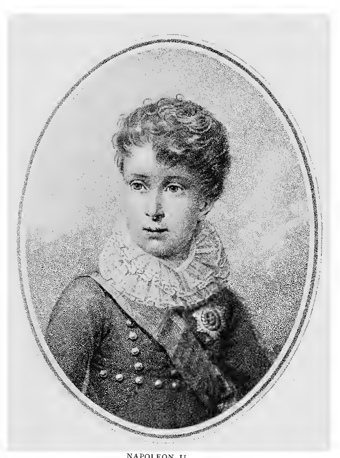
NAPOLEON II., King of Rome, Duc de Reichstadt, etc. From an engraving by Weiss.