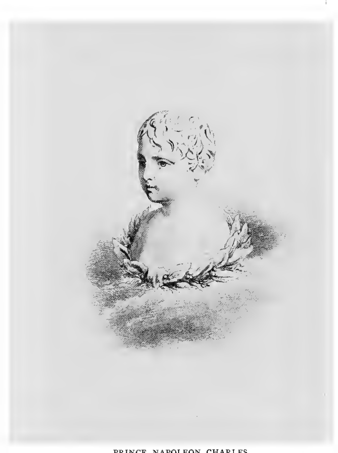
PRINCE NAPOLEON CHARLES. From an engraving by P. Paquet.