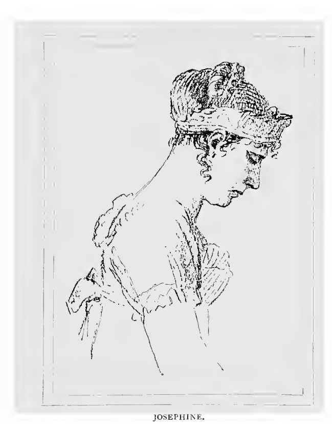
From a sketch by David for his picture of the Coronation.