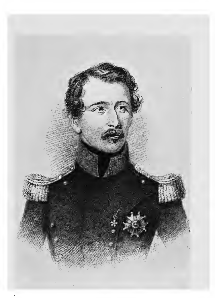
PRINCE LOUIS NAPOLEON. From an engraving by Hall, after a drawing by Stewart.