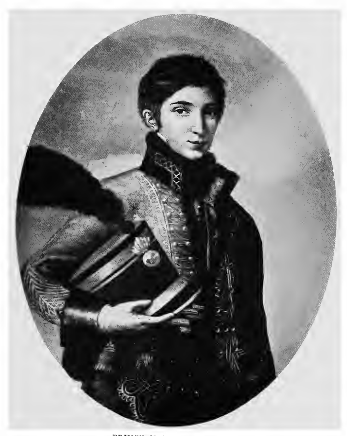
PRINCE NAPOLEON LOUIS. From a picture at Versailles.