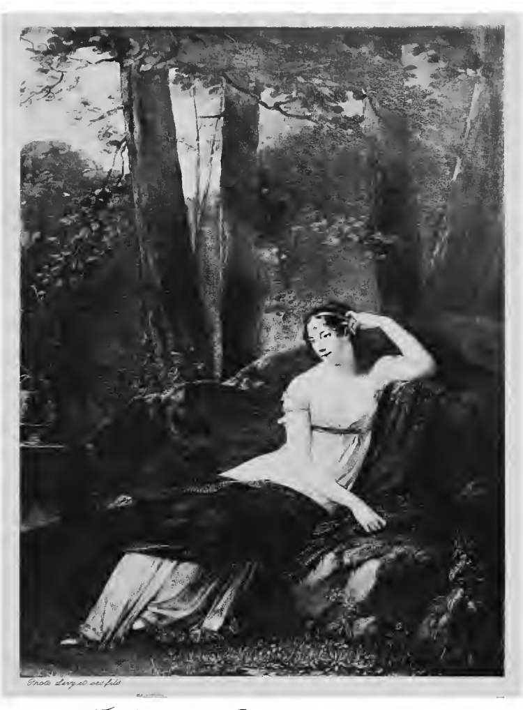
The Empress Tosephine at Malmaison.