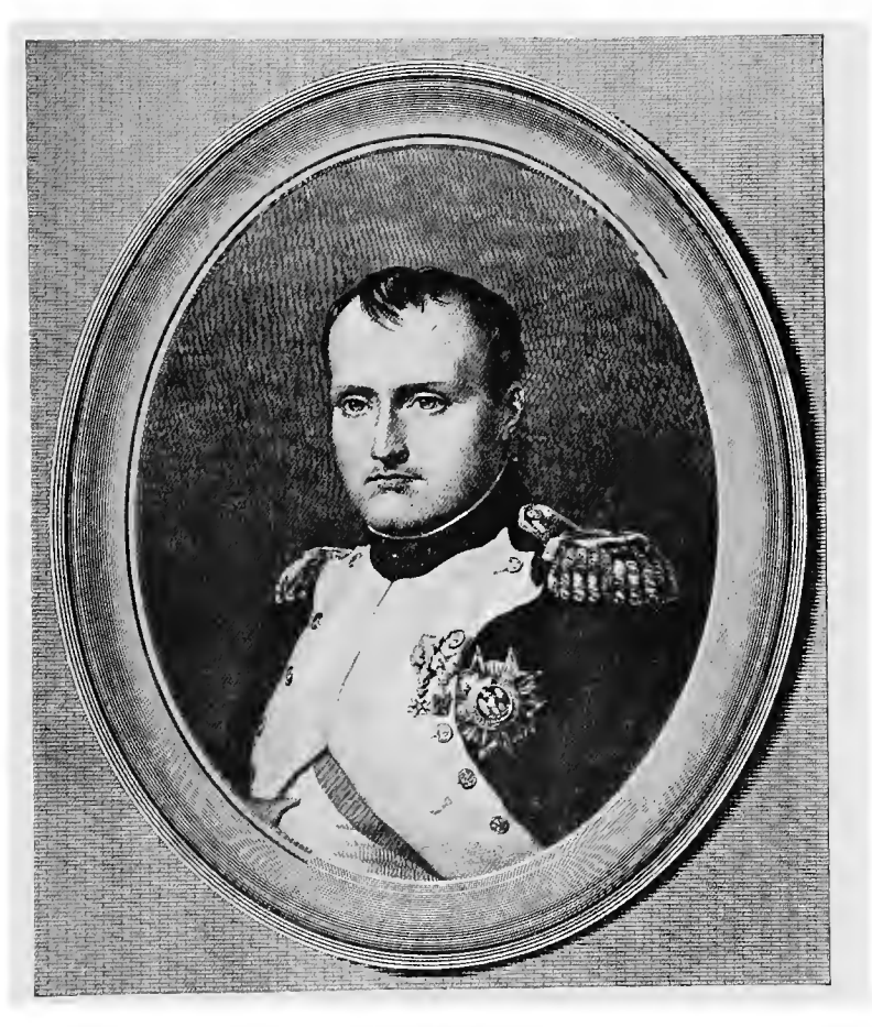
\label{eq:NAPOLEON.} NAPOLEON. From \ n engraving after the picture by C. Steube.