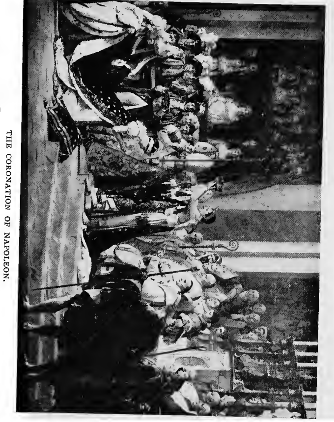
From the painting in the Louvre.