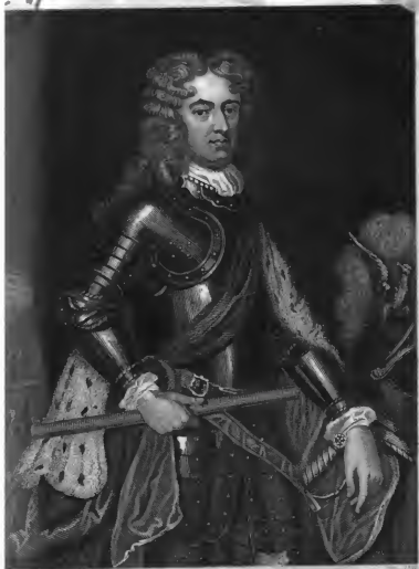
Duke of Marlborough