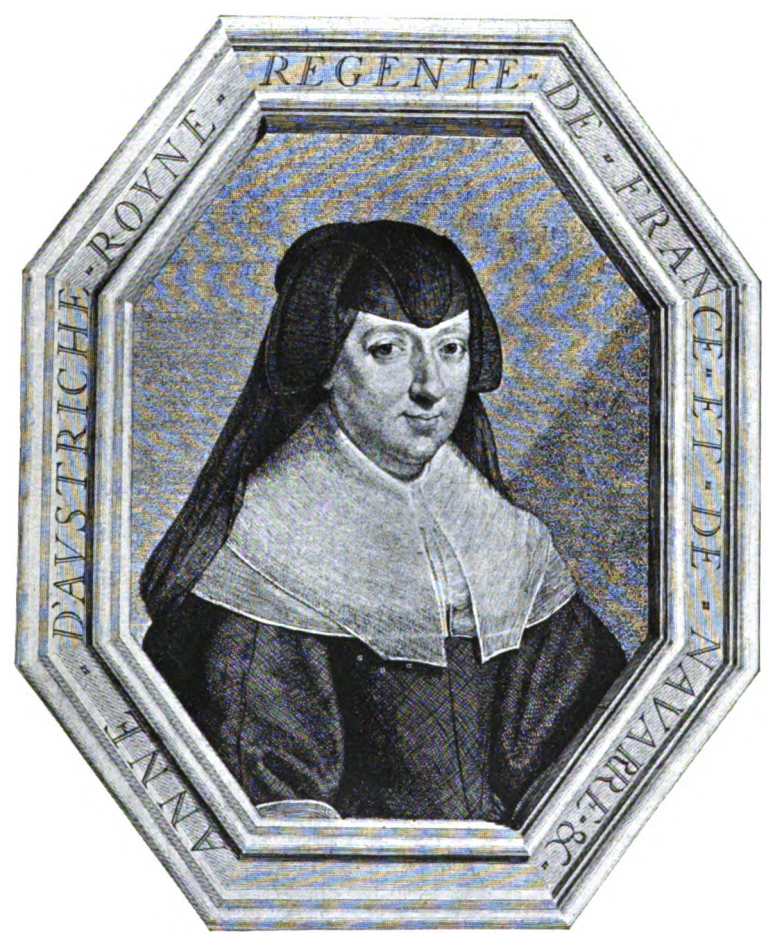
After Ph. Champigne.