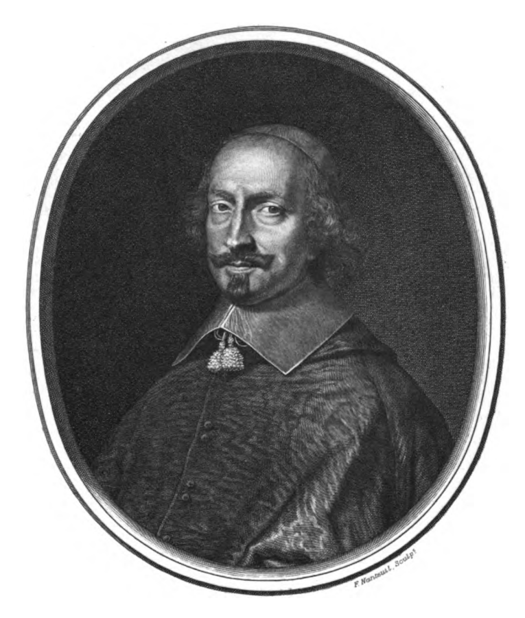
Cardinal Mazarin 1654