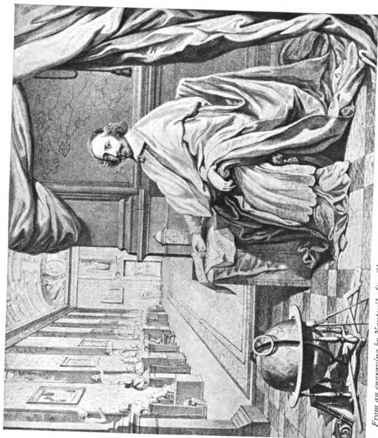
From an engraving by Nanteuil after Chauveau.