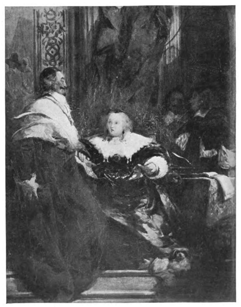
From a sketch by R. P. Bonington. ANNE OF AUSTRIA AND CARDINAL MAZARIN.