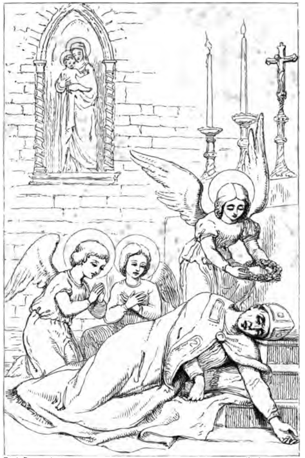
Ferd. Platner inv.