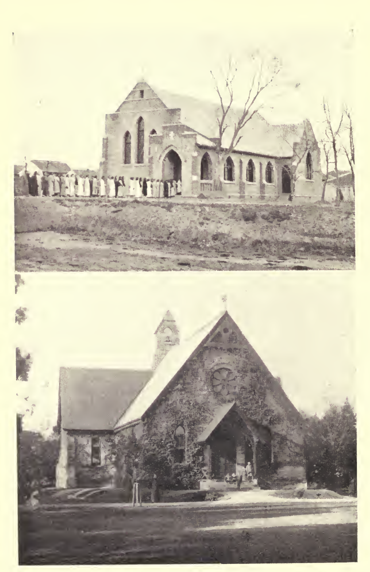
THE SCHOOL CHAPEL, ANKING ST. JOHN'S PRO-CATHEDRAL, SHANGHAI