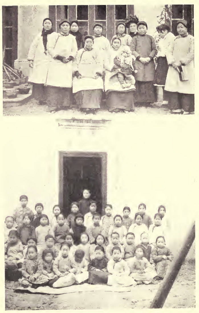
A GROUP OF GIRLS' DAY SCHOOL TEACHERS A TYPICAL GIRLS' DAY SCHOOL