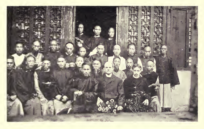
A CONFIRMATION CLASS AT AN OUTSTATION