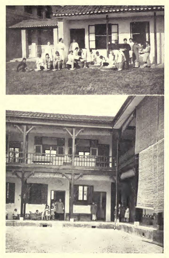
GIRLS OF ST. AGNES' SCHOOL, ANKING, AT THE WASH TUBS THE ORPHANAGE, SHANGHAI