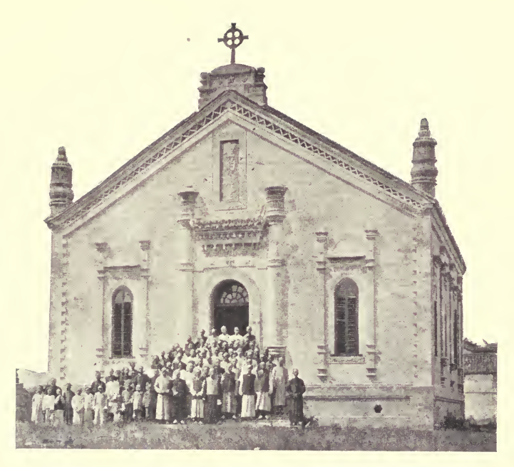
THE CHURCH AND SOME OF THE CONGREGATION AT TAI-HU