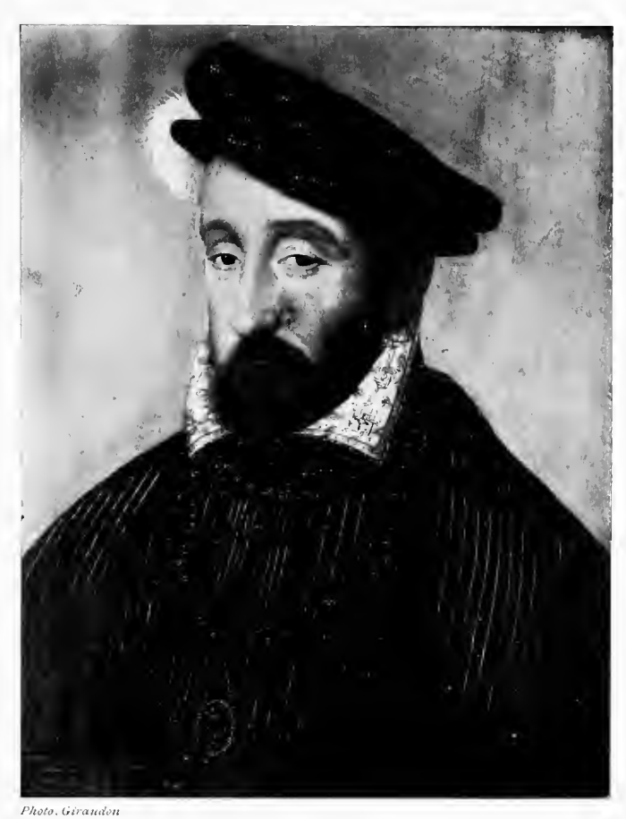
KING HENRY II OF FRANCE From a portrait by François Clouet in the Museum of the Louvre, Paris