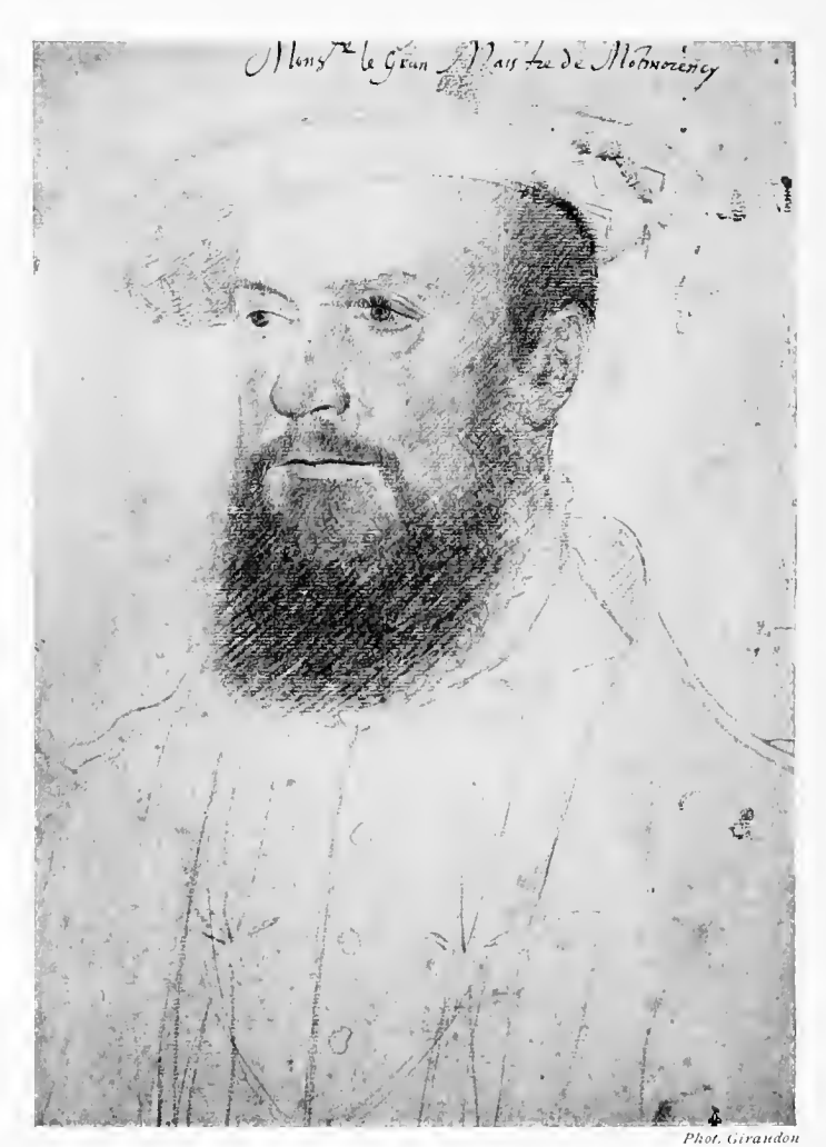
ANNE DE MONTMORENCY From a Clouet drawing at Chantilly