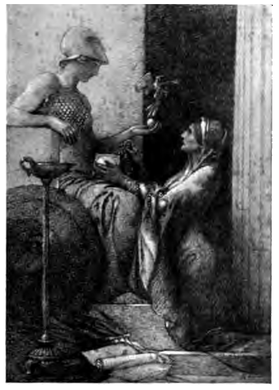
SLAVECED AUVERCETT LEBRARY