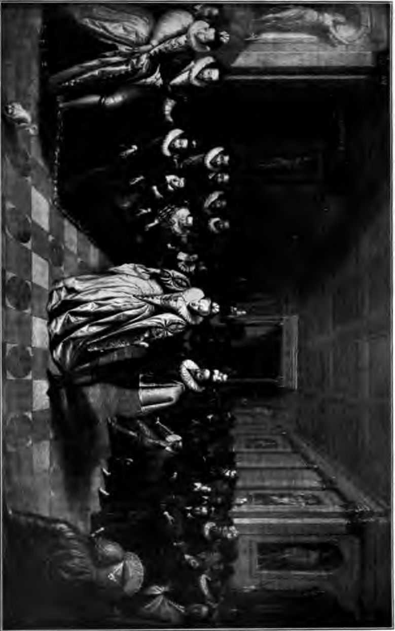
A BALL AT THE COURT UNDER HENRY III, AT THE MARRIAGE OF ANNE, DUKE OF JOYEUSE, AND MARGARET OF LORRAINE, SISTER OF THE QUEEN OF FRANCE Catherine and Henry are seated at the left. From a painting of the French School of the 16th Century in the Louvre