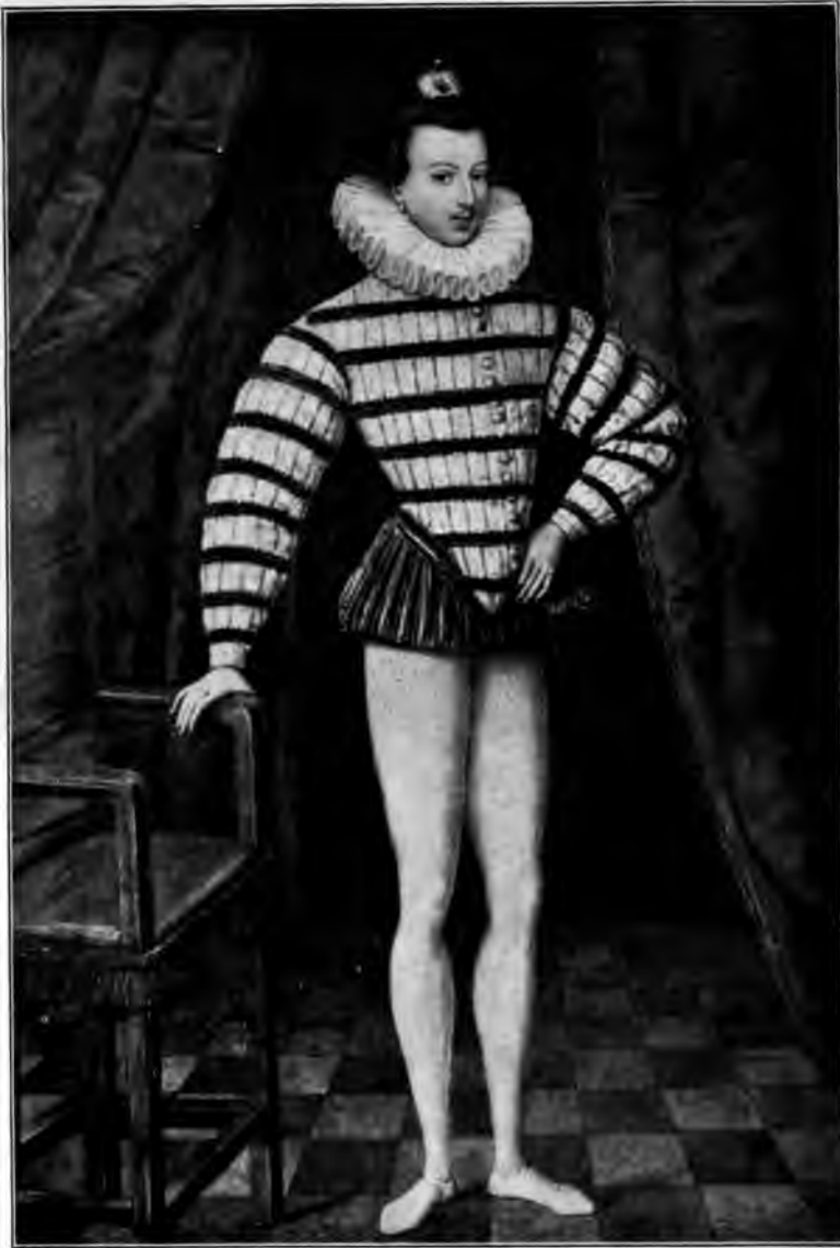
SAINT MAIGRIN—A MIGNON OF HENRY III, CATHERINE'S THIRD SON