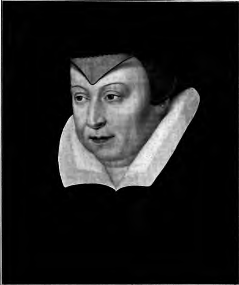
CATHERINE DE MÉDICIS AS QUEEN DOWAGER

From a painting of the French School of the 16th Century in the Louvre