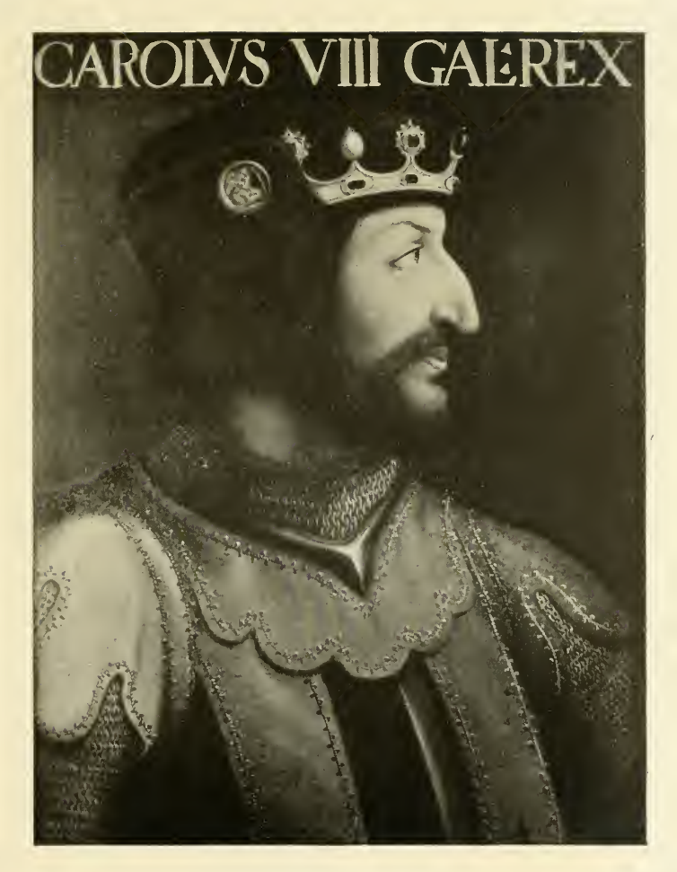
CHARLES VIII OF FRANCE In the Uffizi, Florence, Painter unknown