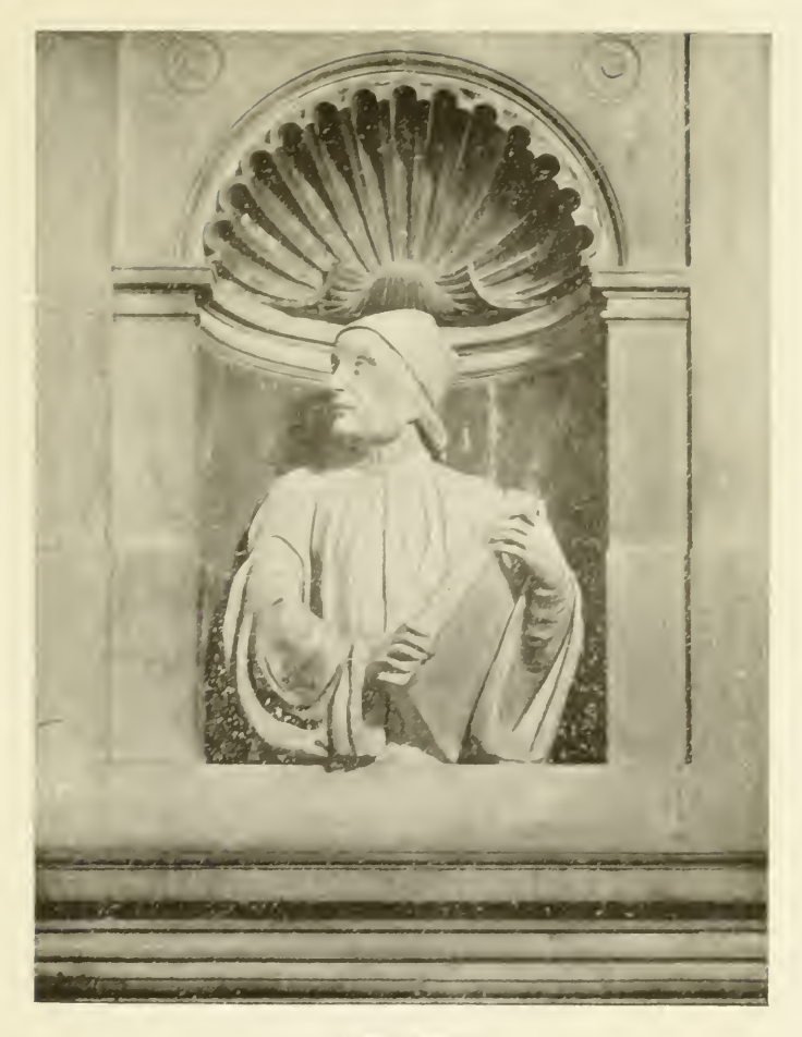
"LIC In Gel inch rene