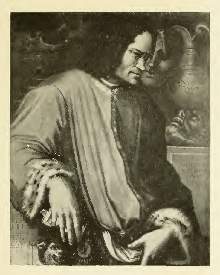
LORENZO DE' MEDICI, BY GEORGIO VASARI