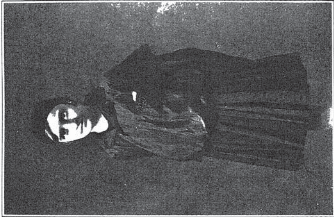
MUSSOLINI'S DAUGHTER EDDA