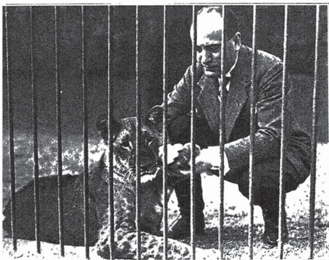
MUSSOLINI AND HIS FAVOURITE YOUNG LIONESS