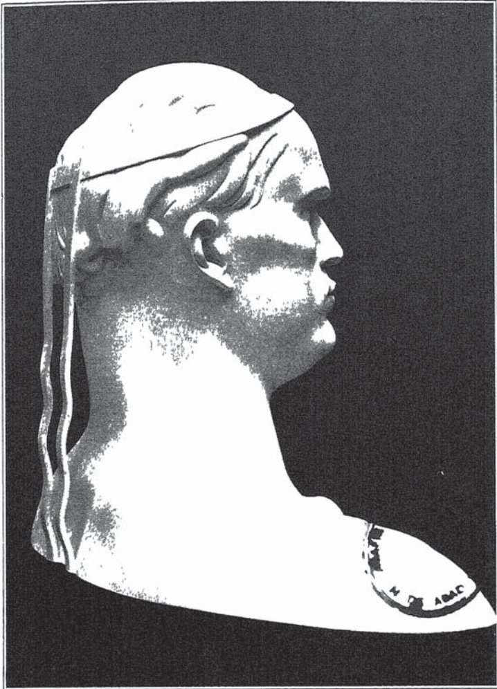
BUST OF MUSSOLINI BY WILDT