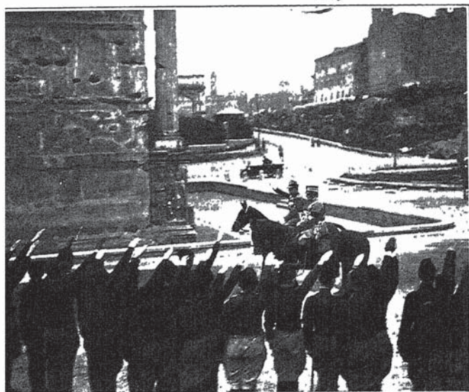
MUSSOLINI IN ROME A Fascist Salute