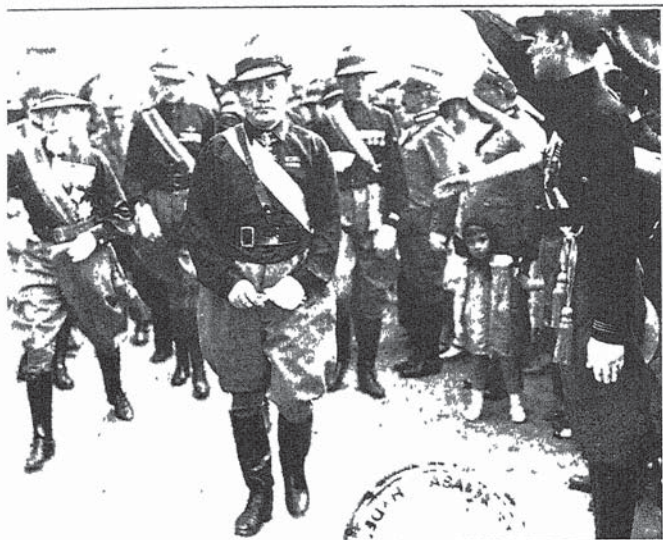
MUSSOLINI AND HIS FASCIST STAFF IN 1922