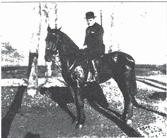
A MORNING RIDE