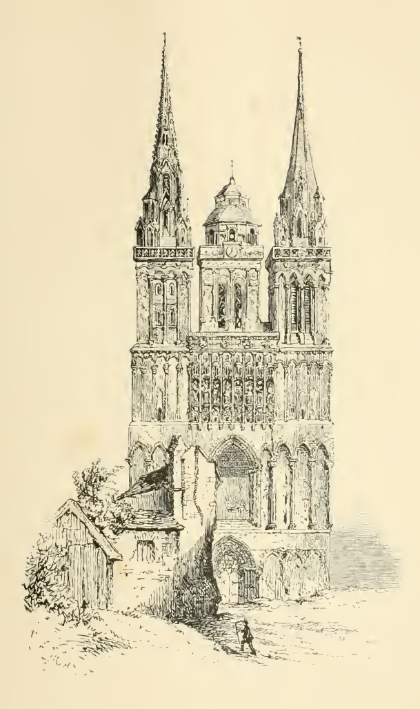
CHURCH OF ST. MAURICE, ANGERS. (To face page 378, vol. ii.