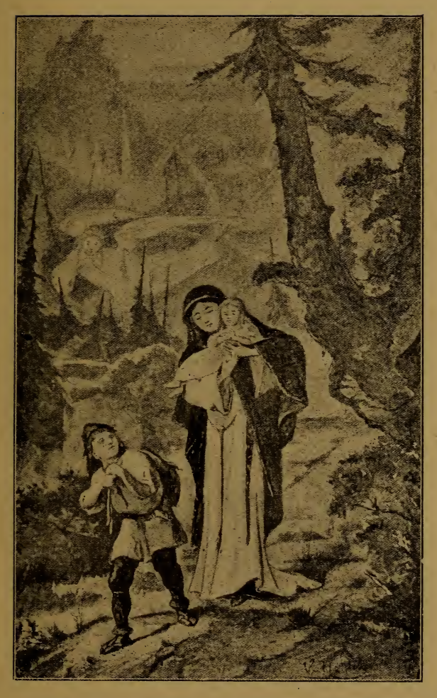
"Look at Berthilda descending the Hohenburg, accompanied not alone by the child, but also by a happy escort of angels."