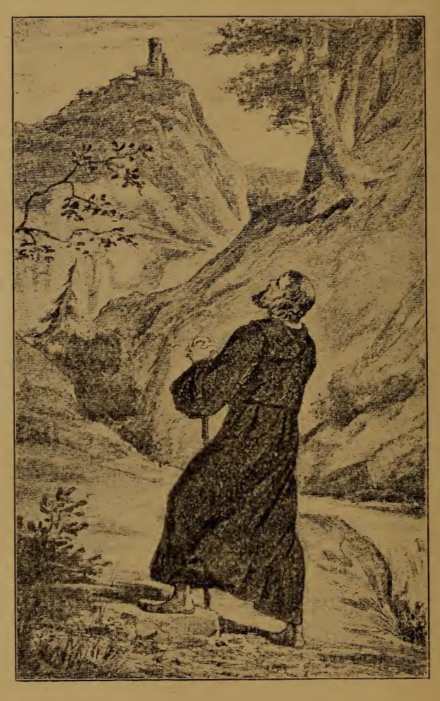
One beautiful summer-day, a large sized man clad in the monastic habit...climbed slowly and heavily the winding mountain-path.