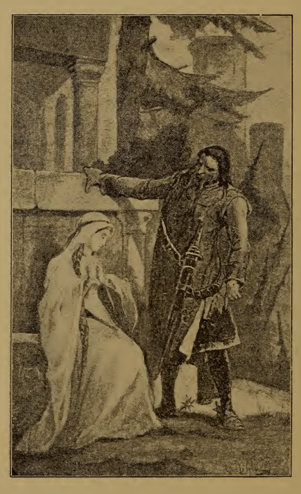
I have made a vow to the Lord, and I will accomplish it, even if it were to cost me my life.