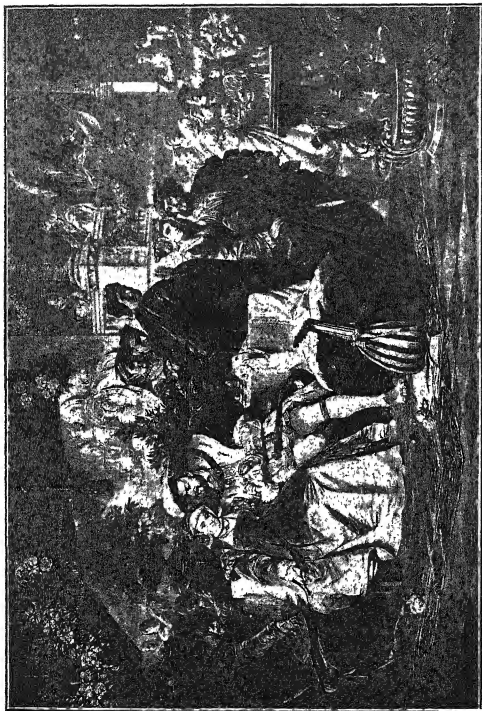
Cardinal Wolsey found himself ushered into the hall where Henry VIII sat wooing Anne Boleyn.—Page 248. Life of Thomas Wolsey.