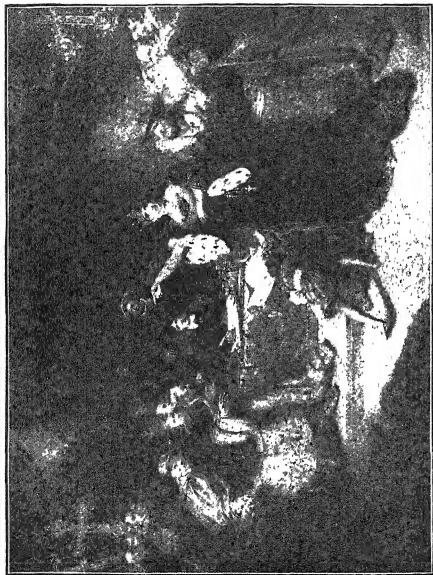
The trial of Katharine at Blackfriars,—Page 208.