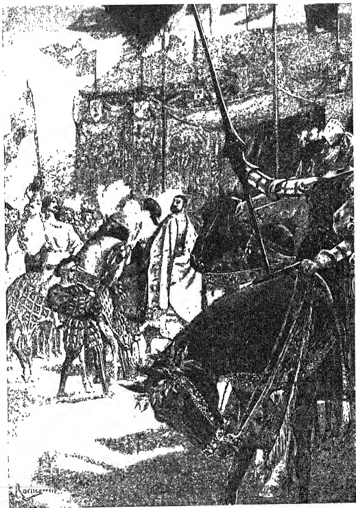
The meeting of Henry VIII. and Francis I on The Field of the Cloth of Gold. Page 107. Life of Thomas Wolsey.