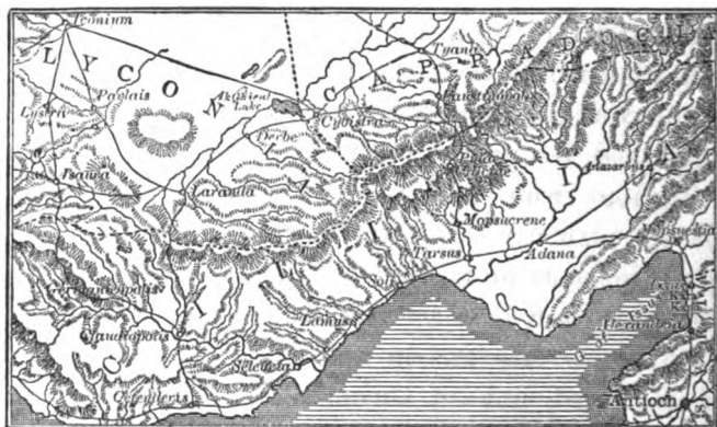
THE COUNTRY ROUND TARSAUS.

indeed, Paul and Silas took this route and passed through the narrow gorge under its frowning cliffs of limestone, clothed here and there with pine and cedar, which to the Crusaders presented an appearance so terrible that they christened it the Gates of Judas, how far must they have been from imagining, in their wildest dreams, that their footsteps—the footsteps of two obscure and persecuted Jews—would lead to the traversing of that pass centuries afterwards by kings and their armies. How