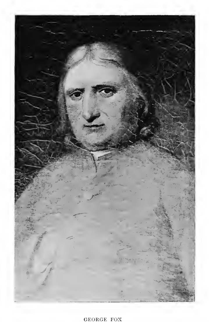
From the Portrait by Sir Peter Lely, in the possession of the Trustees of Swarthmore College