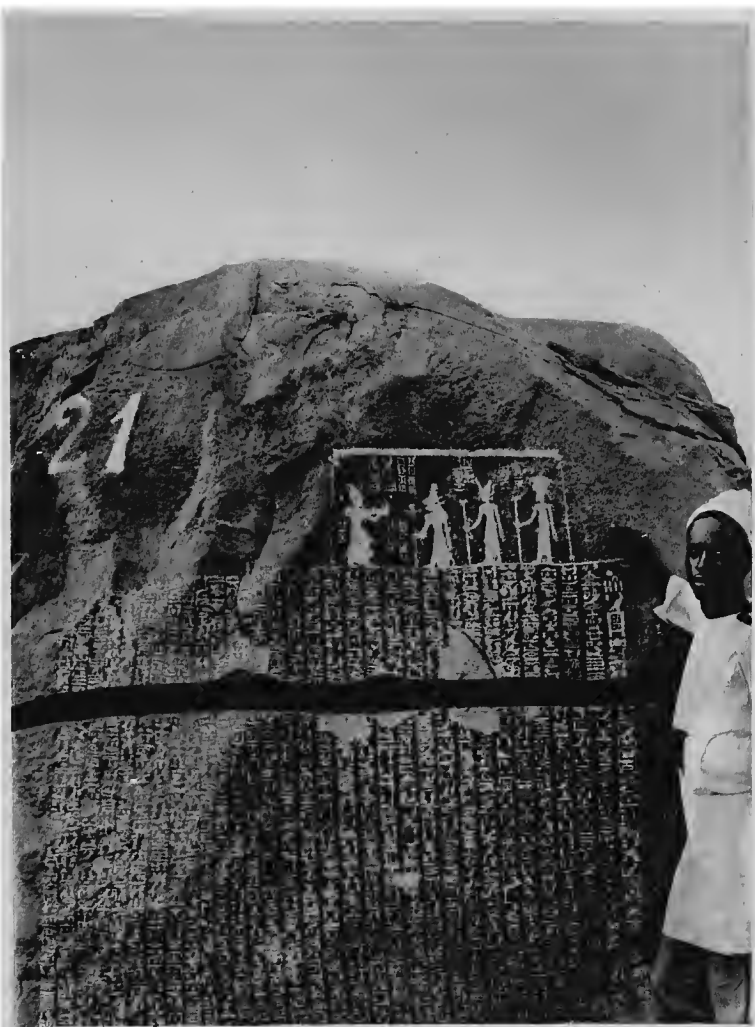
21. Rock inscription, near the temple of Isis, Philae, Egypt.